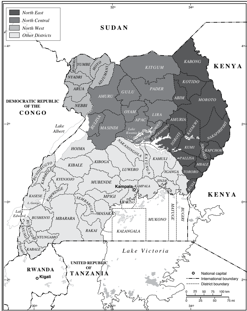
Figure 1: Map of northern Uganda