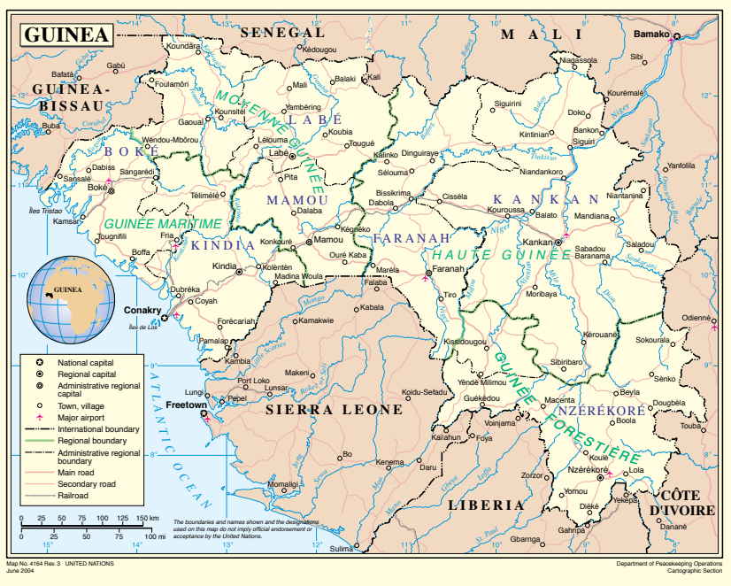
Map No. 4164 Rev. 3 UNITED NATIONS June 2004