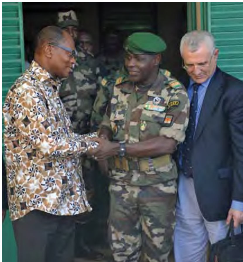
(L to R) Mohamed Ibn Chambas, then Head of the 15-nation regional economic bloc ECOWAS, Salou Djibo of Niger and UN Representative Said Djinnit after a meeting on February 21, 2010 at a military compound in Niamey.